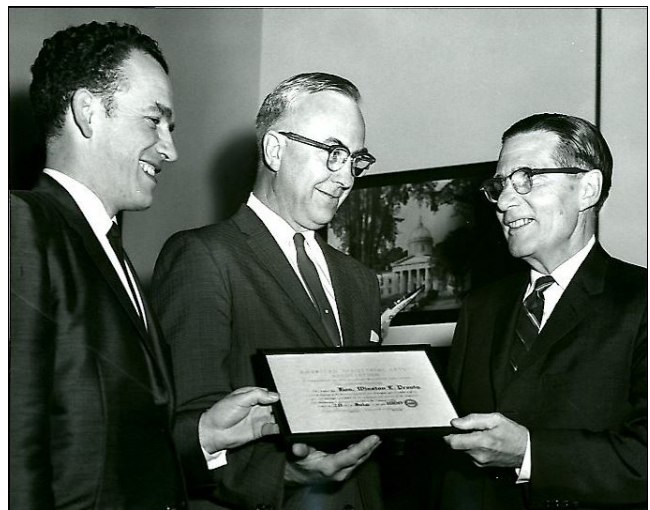
Above: The American Industrial Arts Association recognized Senator Winston Prouty for sponsoring a program of Federal Assistance to Industrial Arts Education.